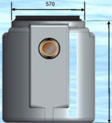
Inlet End Elevation