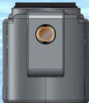
Outlet End Elevation